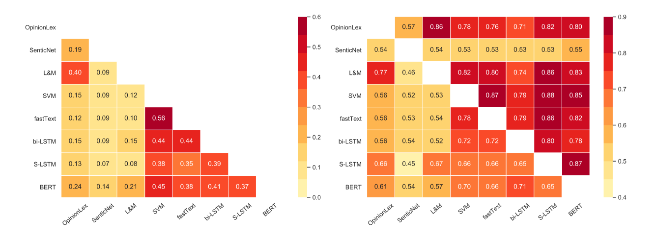
Figure 2: Pairwise correlation matrices of eight model predictions on the StockSen test data. The left matrix is symmetric, showing high correlations across learning-based models. The right matrix shows correlations for the bullish/positive (upper triangular) and bearish/negative samples (lower triangular).

respectively. Then we calculate the metrics as follows: